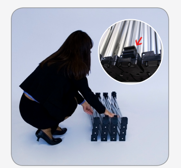
1. Remove frame from case and place on floor. Place frame with the slider(s) for light on the top facing you.