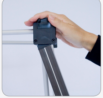
6. Start the top of the frame, insert the pointed end of the channel bar into the slot in the bracket at the top of the frame.