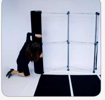
Slowly run your hands down the sides of the panel, attaching magnetic strips to the channel bars and straightening as you go.