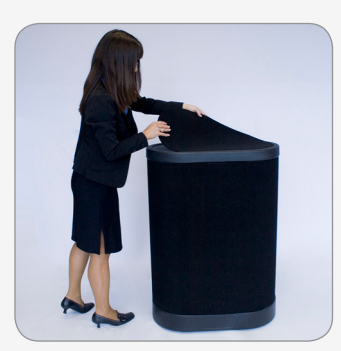
15. Place the top lid on the podium.