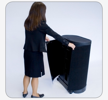
14. Wrap the panel for podium and attach the edges by velcro.