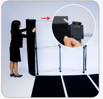
Lift end panel and guide front notch of plastic plate over front peg. Hook the other side on the panel peg at the back of the frame.