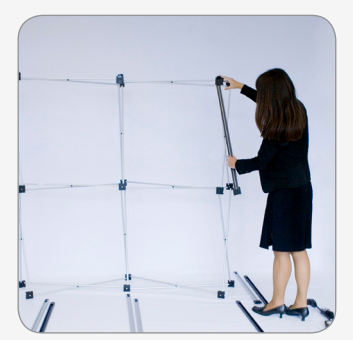
5. Make sure to flip the magnet side to be the front side when you slide it to the frame.

4. Set up the channel bars to the frame. 4 black channel bars go on the 4 outer lower positions (There's velcro which holds down the lower corner of the endcaps) and rest of channel bars go on the middle lower positions and all top positions.